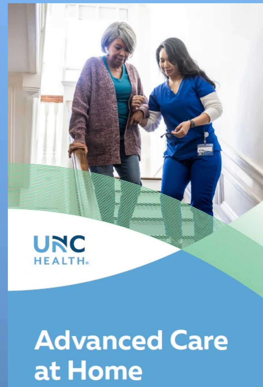
1. Patient brochure, part of revised marketing materials