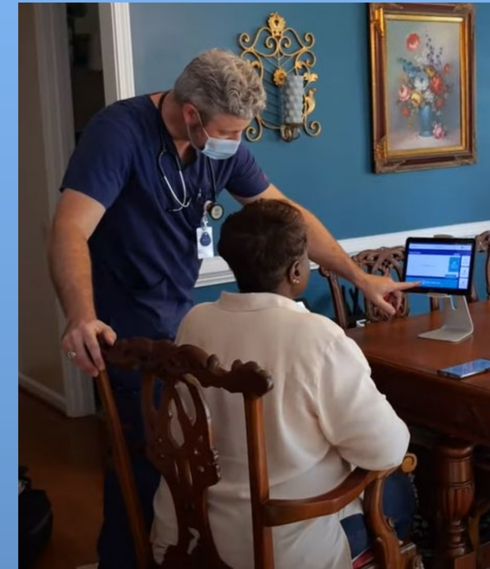
2. Frame from promotional acquisition video, explaining what to expect on day of admission